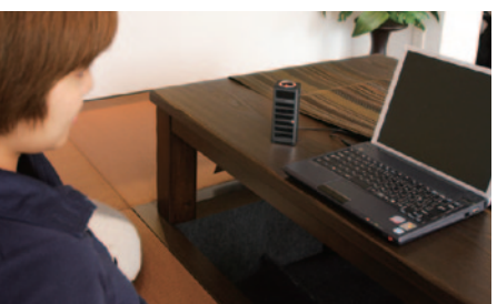
Enjoy casual video chat and hands-free telephone calls while relaxing at home.