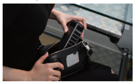
Compact, lightweight, and easy to carry anywhere.