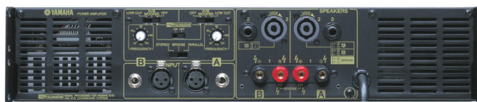
P7000S Rear Panel