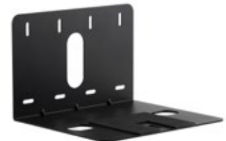
VC-AC03 Wall Mount

Lumens ™ Brilliance by Design www.MyLumens.com