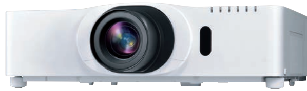
Front 3/4 View

Wireless Presentation Compatible: Connect the projector to a computer or your network using the optional USB wireless adapter (part number USBWL11N). The adapter supports IEEE802.11b/g and the latest 11n.