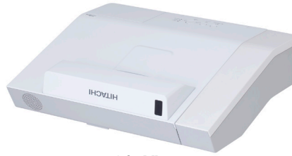
3/4 View (with cable cover)

With 3,300 ANSI lumens brightness and WXGA 1280 x 800 resolution, the CP-TW3005 will captivate the full attention of any audience by delivering your message with clarity and impact. Vivid colors. Bold graphics. Crisp text. It also features a high contrast ratio, long lamp life, cloning function enabling you to copy settings data from one projector to others of the same model, and is wireless presentation ready. Plus, embedded networking gives you the ability to manage and control multiple projectors over your LAN (scheduling of events, centralized reporting, image transfer and email alerts). Best of all, the high performance CP-TW3005 is exceptionally reliable and offers a very low cost of ownership.