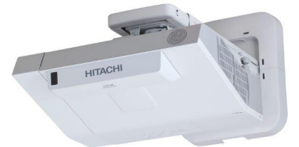
Wall Mounted (with cable cover)