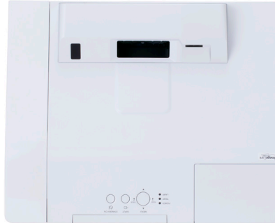
Top View (with cable cover)