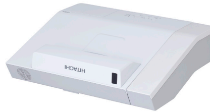
3/4 View (with cable cover)

With 3,300 ANSI lumens brightness and WXGA 1280 x 800 resolution, the CP-TW3005 will captivate the full attention of any audience by delivering your message with clarity and impact. Vivid colors. Bold graphics. Crisp text. It also features a high contrast ratio, long lamp life, cloning function enabling you to copy settings data from one projector to others of the same model, and is wireless presentation ready. Plus, embedded networking gives you the ability to manage and control multiple projectors over your LAN (scheduling of events, centralized reporting, image transfer and email alerts). Best of all, the high performance CP-TW3005 is exceptionally reliable and offers a very low cost of ownership.