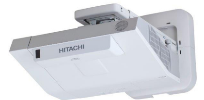
Wall Mounted (with cable cover)