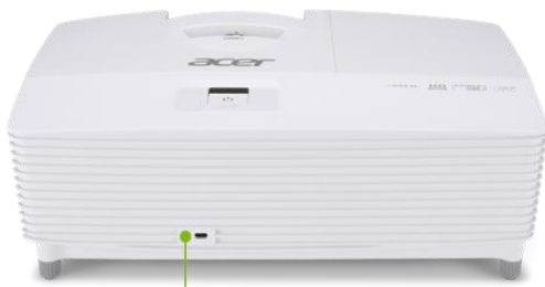
Kensington lock slot